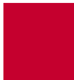
Carey Red PMS 200 CMYK: 16, 100, 87, 7 RGB: 193, 2, 48 #C10230